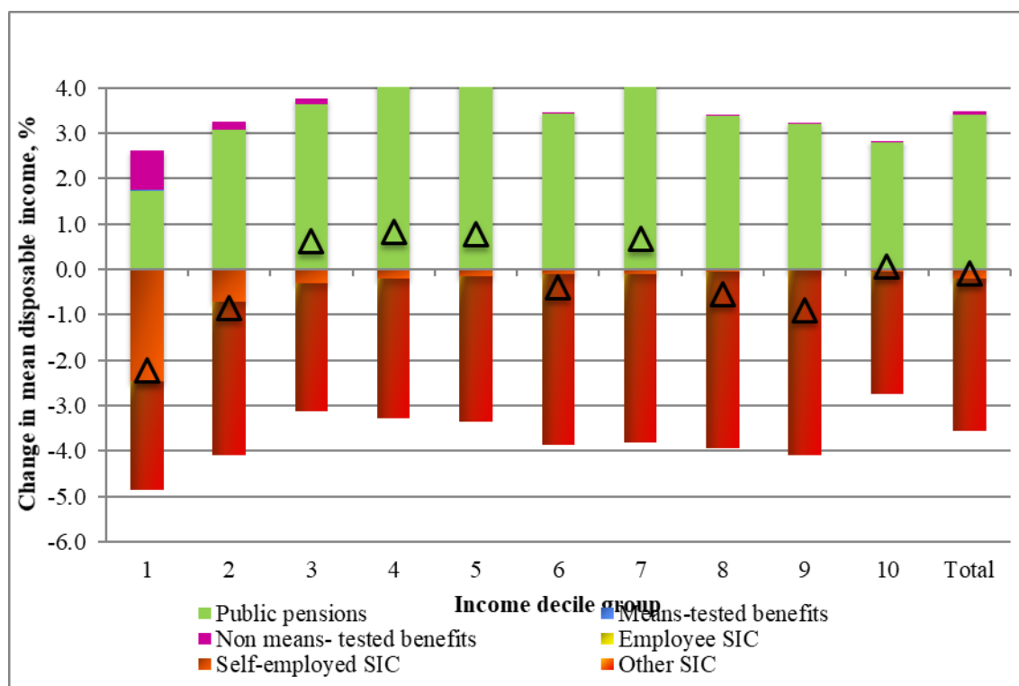
Figure 2 – Policy Effects 2022-23, with custom (1) indexation on dataset HU_2021_b1

Notes: shown as a percentage change in mean equalized household disposable income by income component and income decile group. Income decile groups are based on equalized household disposable income in 2022, using the modified OECD equivalence scale. Policy rules for each year have been applied to the same input data, deflating monetary parameters of 2023 policies by Eurostat's Harmonized Index of Consumer Prices (HICP).